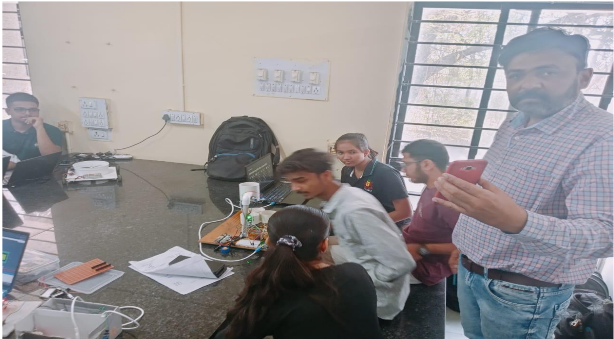
Students Representing their Project among Internal Experts